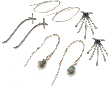
Minimalist Soldered Earrings