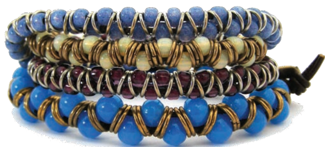
Zig Zag Bracelet