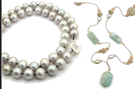
Bead Knotting I & II Traditional & Spaced Knotting