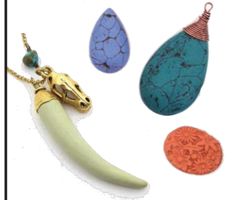
Faux Bone & Stone