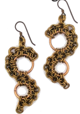
Stepping Stone Earrings