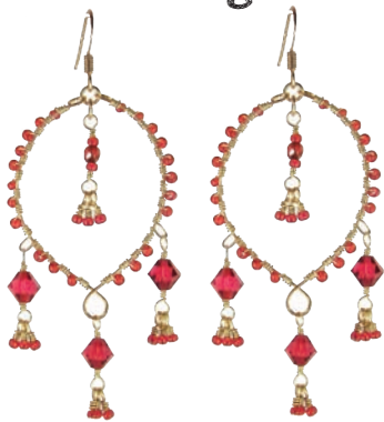
Bead Wrapped Wire Earrings