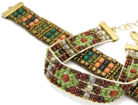
Aqua Verde Bracelet